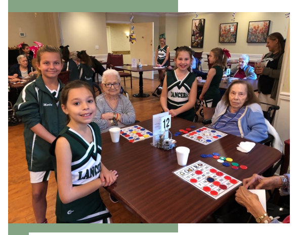
The Lancers Cheerleading Squad came in for a rousing cheer and to help with Bingo.