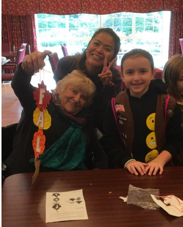
Girl Scout Troop 21110 came in for a Fall Craft.

We had the Peanut Shell group from the YMCA here in costume. The parade led by the Dino.