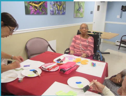
Getting crafty on Reflections!