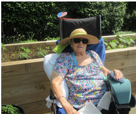
Enjoying the weather!